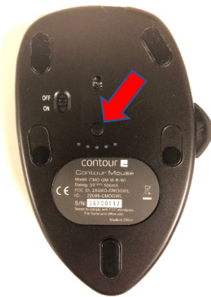
(Cursor speed button)

(*If you do not pair the dongle within 1 minute, unplug/re-plug the dongle, and try again.)