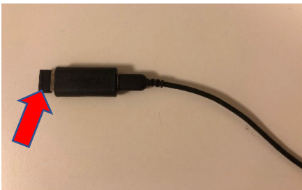
(Dongle connected to the USB extender)

To improve wireless connectivity and reduce lag, make sure to connect the dongle to the USB extender cable found in the product packaging, and the other end directly into your computer USB port.